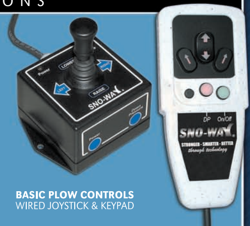
BASIC PLOW CONTROLS WIRED JOYSTICK & KEYPAD

SNO-WAY RESERVES THE RIGHT TO CHANGE PRODUCT DESIGN, CONSTRUCTION, MATERIALS AND SPECIFICATIONS WITHOUT NOTICE UNDER ITS ONGOING PRODUCT IMPROVEMENT PROGRAMS. SEE YOUR AUTHORIZED SNO-WAY DEALER FOR COMPLETE WARRANTY DETAILS.